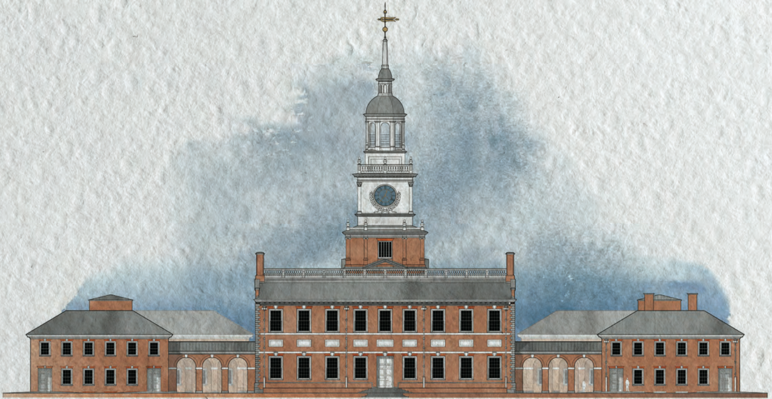
Rendering of The Morris Family Center for Law & Liberty Complex which is currently under construction and slated to open July 2022.