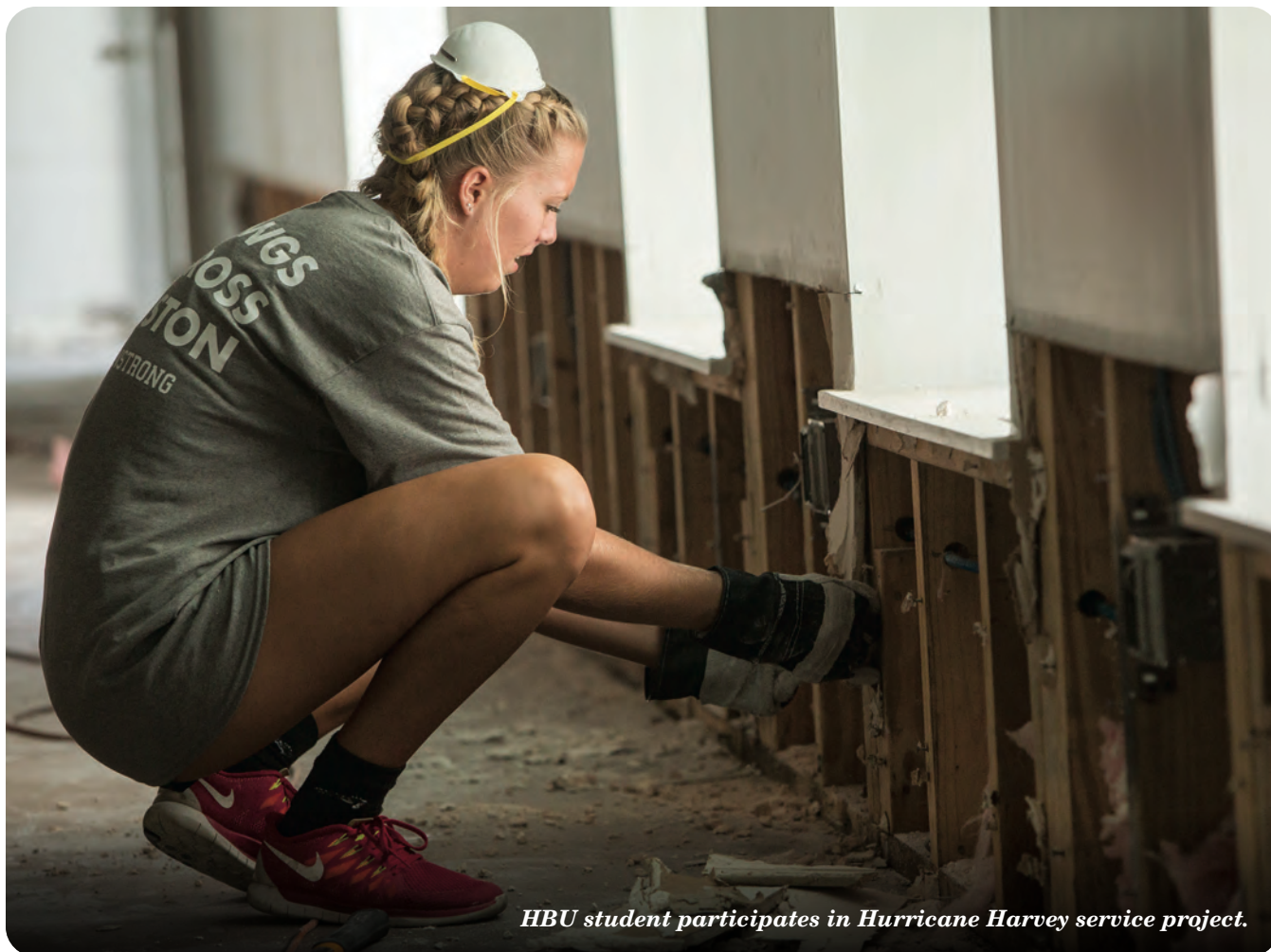
HBU student participates in Hurricane Harvey service project.