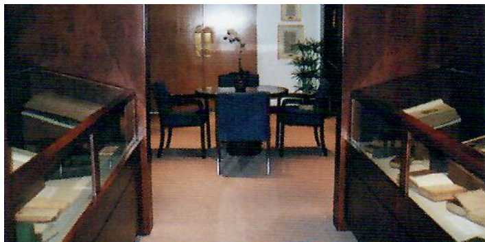
Bible in America Museum in the Moody Library, 2003