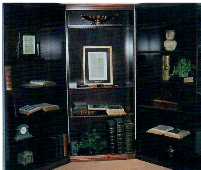
Displays in Bible in America Museum, 2003