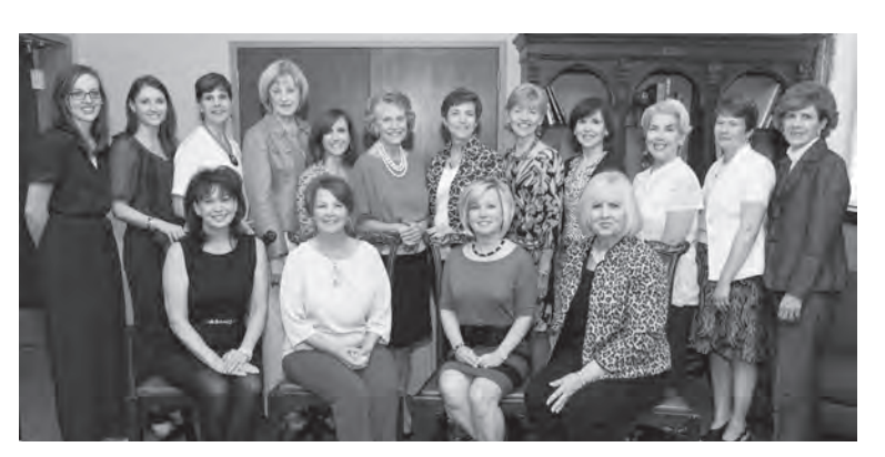
New members and other attendees