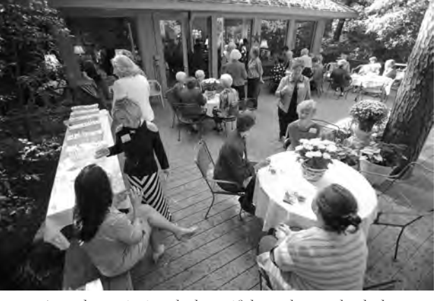
Attendees enjoying the beautiful weather on the deck