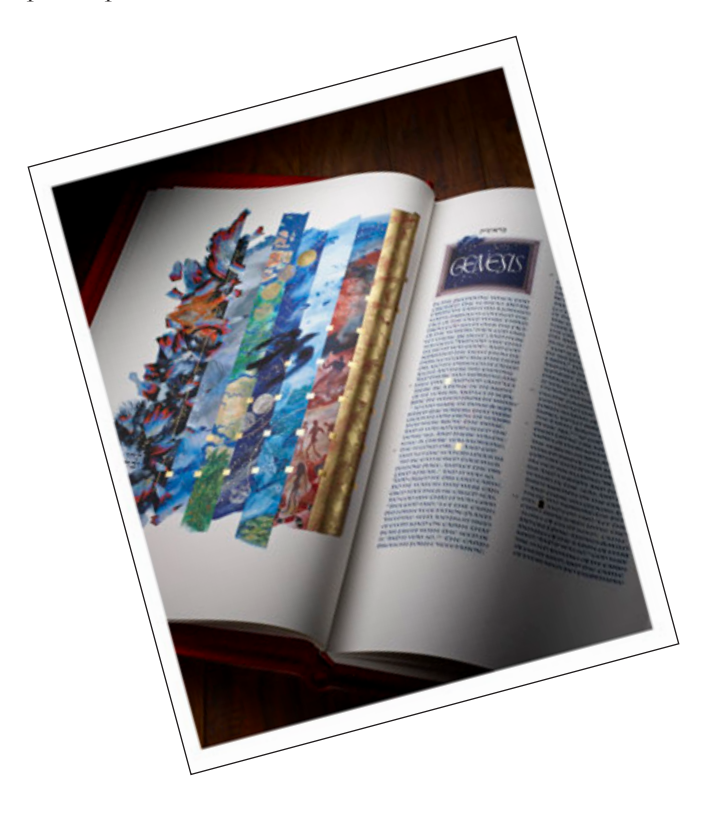
The opening page of Genesis in volume 1 of the St. John's Bible beautifully depicts the seven days of creation week.

With three volumes now in the Dunham's collection, funds continue to be sought to purchase the remaining four Old Testament volumes, at the cost of $20,000 per volume. Donations in any amount are welcome. Some donors may wish to donate an entire volume in honor or memory of a special person. All donations are tax-deductible.