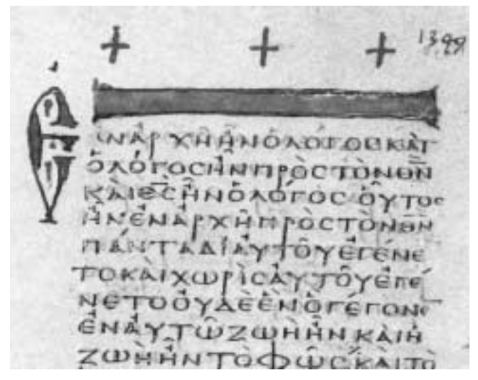
The beginning of John's gospel, from the Codex Vaticanus

The Bible in America Museum's newest acquisition is a magnificent limited edition facsimile of the Codex Vaticanus , one of the earliest complete manuscripts of the Bible. The earliest Bible manuscripts were written in Hebrew and Greek on papyrus or parchment (made from animal skins) scrolls. Soon the Christians began using a book or codex format rather than scrolls for their