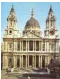
St. Paul's Cathedral, London

We would like to correct three errors or misimpressions from our last issue, noted by some of our readers: