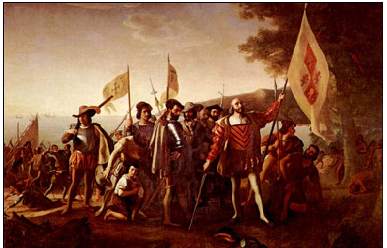
October 13, 1492 - Landing of Columbus on San Salvadore. Painting from Rotunda of U.S. Capitol

Almost every school child knows that “In 1492, Columbus sailed the ocean blue” and opened the western hemisphere to European settlement. What is often not known, however, is how Columbus’ Bible studies influenced his voyages of exploration. Christopher Columbus was a student of the Latin Vulgate Bible. He collected numerous quotes from the Bible as well as from other writers to support his vision of exploration to the East. Columbus’ manuscript of what is known as his Book of Prophecies is in the library of the Cathedral of Seville in Spain. One of the verses in his Book of Prophecies was Isaiah 59: 18-20, “He will repay the islands their due. From the west, men will fear the name of the LORD, and from the rising of the sun, they will revere his glory. For he will come like a pent-up flood that the breath of the LORD drives along. The redeemer will come to Zion.” Columbus also cited many other verses from the Scriptures, especially the Old Testament, which spoke of the islands, the ends of the earth, or all nations and tongues coming to the Lord. Columbus believed once the Gospel had been brought to the uttermost islands,