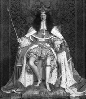
King Charles II in Coronation Robes

The 1660's brought epic changes to England – a Civil war, execution of a King, experiments and reforms in church organization and government, and a monarchy both restored and