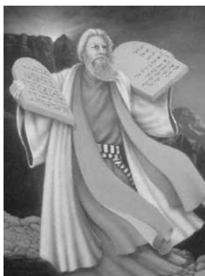
Moses and the Ten Commandments, from the opening mural in the new Dunham Bible Museum

Please notify us of any changes or corrections in your address. We also welcome hearing from our readers and Museum visitors. If you would like to receive the Dunham Bible Museum News by e-mail and save the University postage, send your email address to dseverance@hbu.edu .