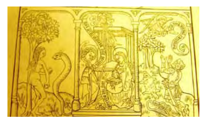
Detail of the Annunciation from Biblia Pauperum in the British Library

Biblia Pauperum , or "Poor Man's Bible" was a unique kind of Bible. In a book of 40 pages, the redemptive life of Christ was visualized and interpreted in pictures and texts. A key event in the life of Jesus was the central image on each page. Bordering to the right and the left were two Old Testament episodes which prefigured that event in Jesus' life. Above this were images of two Old Testament prophets, with Scripture quotes coming out of their mouths, not unlike comic books. Below the central picture were two more Old Testament prophets and their reinforcing interpretative quotes. These picture studies were patterned after manuscript versions of typology studies that date back as early as the twelfth century.