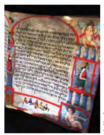
First section of 17th century Italian scroll of Esther