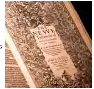
The Dunham Bible Musuem's 1611 King James Bible is one of about 200 of the first edition remaining today.

Both of the winning essays can be read online at the Bible Museum's website: www.hbu.edu/biblemuseum. Select "Tour of the Museum" and scroll through "From Manuscript to Printed Word" for the essay on the Esther scroll; scroll through "English Bible" for the essay on the King James Bible.