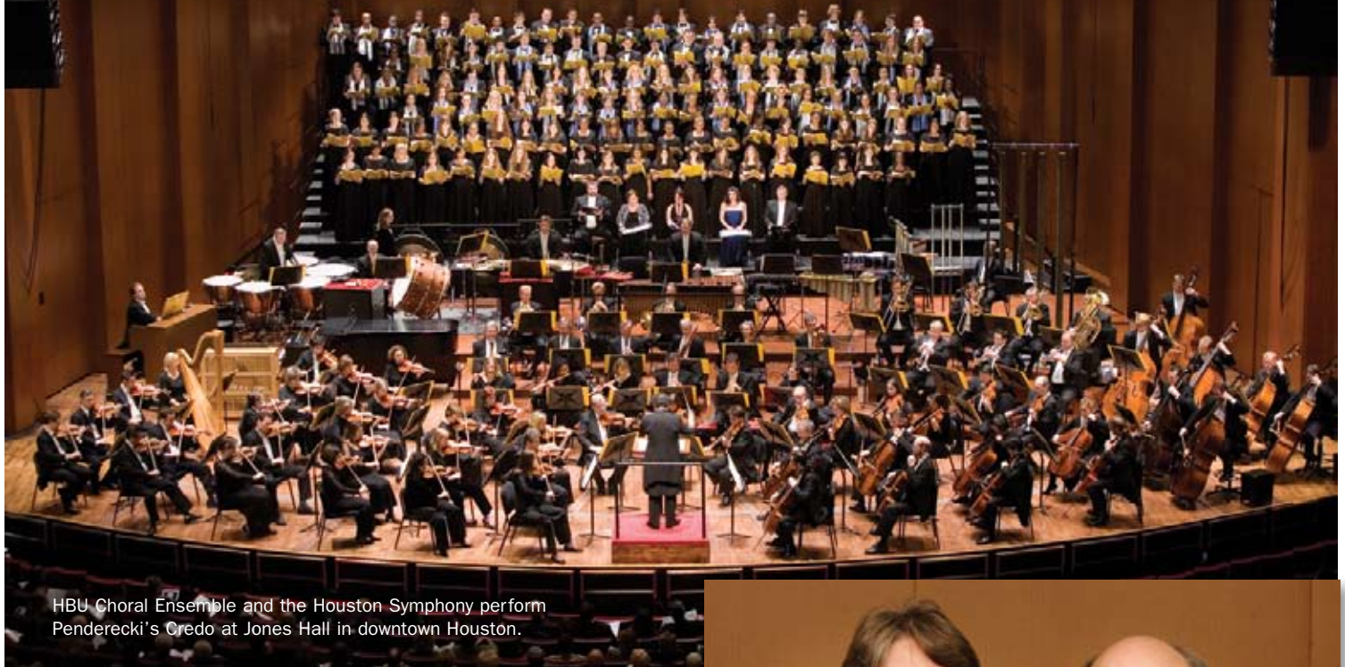
HBU Choral Ensemble and the Houston Symphony perform Penderecki's Credo at Jones Hall in downtown Houston.

It was a week of exciting performances and intriguing speakers, all based on one work by one man – Credo by Polish composer Krzysztof Penderecki.