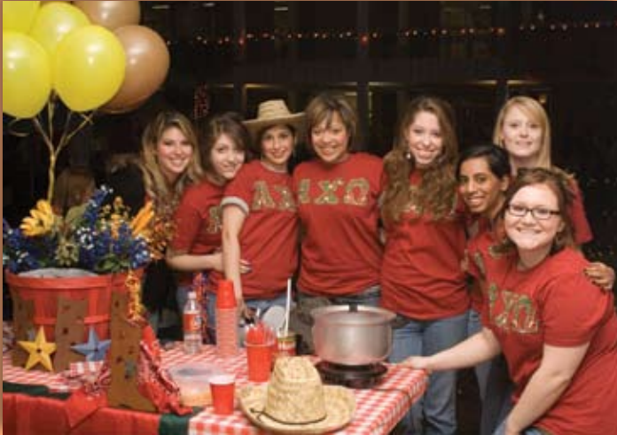
The Alpha Chi Omega ladies wrangle up their best batch of Texas chili for the annual campus-wide chili cook-off.