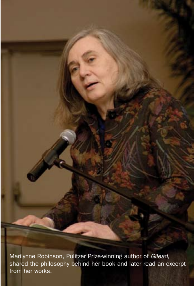
Marilynne Robinson, Pulitzer Prize-winning author of Gilead , shared the philosophy behind her book and later read an excerpt from her works.

“The Credo conference has gifted HBU and Houston in so many ways, but none as important and deeply meaningful as the experiences that have been shared with our students.”