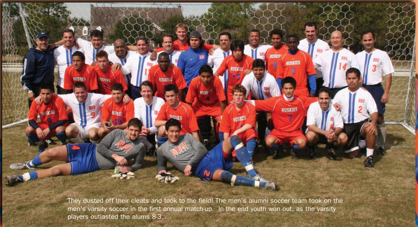
They dusted off their cleats and took to the field! The men's alumni soccer team took on the men's varsity soccer in the first annual match-up. In the end youth won out, as the varsity players outlasted the alums 8-3.