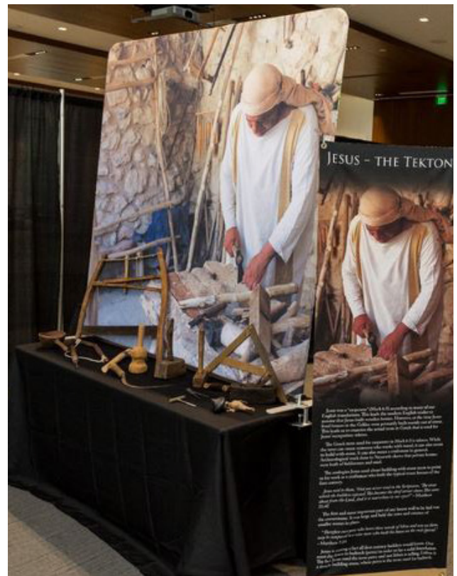
Exhibit of tools such as Jesus would have used in the carpentry shop in Nazareth.