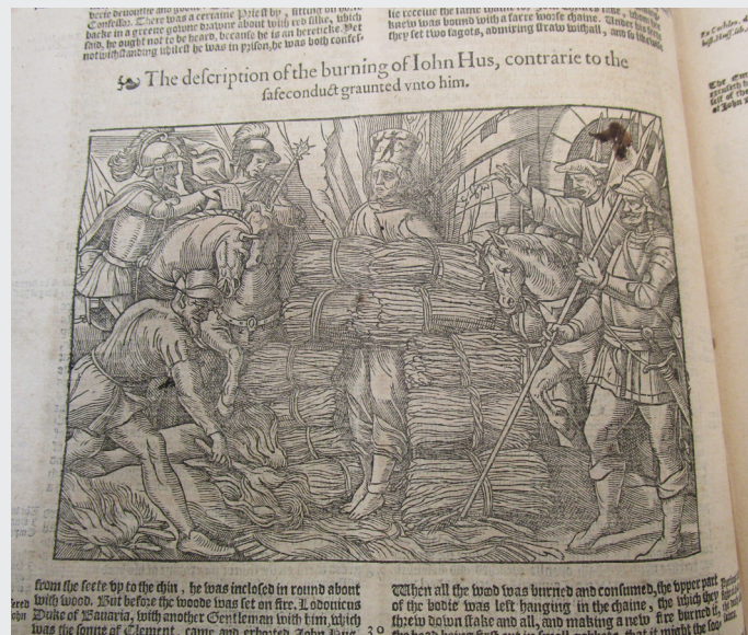
Illustration from the 1596 "Actes and Monuments" showing Pastor John Hus being burned at the stake, though he had been given a safe conduct to appear at the Council of Constance.

Numerous woodcuts, vividly illustrated the torture Christians endured for their faith. For Foxe, history was a struggle between good and evil, truth and error. His sweeping overview of all church history saw God's Providence preserving and building His Church in spite of persecution and opposition. This view of history was influential in early America as well as England.